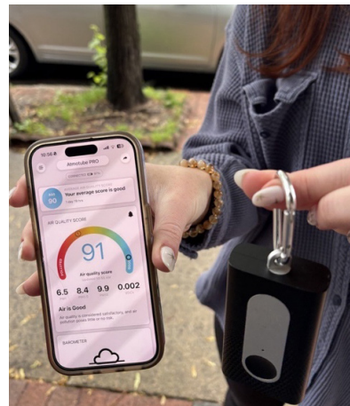
▲ Smart phone app (left) displaying air quality data collected in real time from Atmotube air sensor (right).

These truck counts and data collection efforts enable us to create hands-on opportunities for impacted community members to learn about the dangers of dirty diesel trucks used in port and warehouse operations. It also provides concrete evidence to motivate state and local officials to embrace the changes we seek like the rejection of (A4967/S3817), which proposes delaying implementation of the state ACT Rule (Advanced Clean Truck Rule) another two years and support for the NJ Indirect Source Review bill (A4679/S3546), which aims to curb pollution from port and warehouse operations. To learn more about Why We Count , contact CHP's Kelli Koontz-Wilson or Tolani Taylor , our Zero Emissions and Warehouse Organizer.