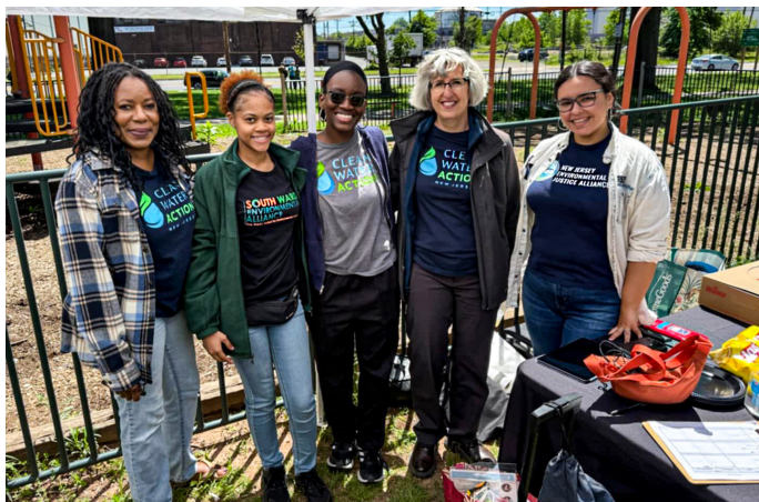
▲ Coalition of Healthy Ports members pictured after the Truck Count in Elizabeth, NJ.