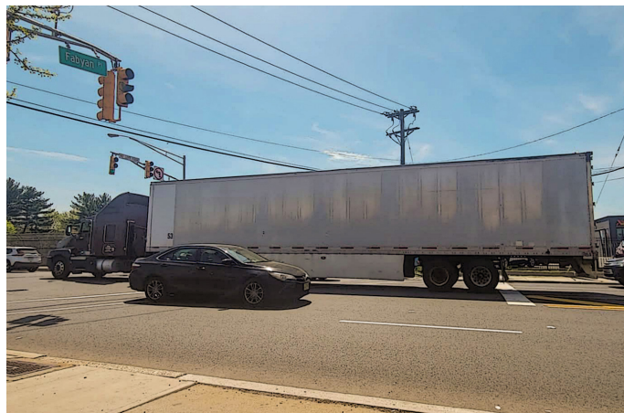
▲ Truck Count in Newark, NJ organized by South Ward Environmental Alliance. (April 2025)

Clean Water Action will be hosting our annual Autumn Toast to a Healthy Environment at Weequahic Park (Newark, NJ) — with silent and chance auctions, games, music, food, good company, and more! We'd love to see you on Saturday October 18th, 2025 from 1-4 pm! Please visit cleanwater.org/autumntoast to buy tickets, become a sponsor, donate an auction item.