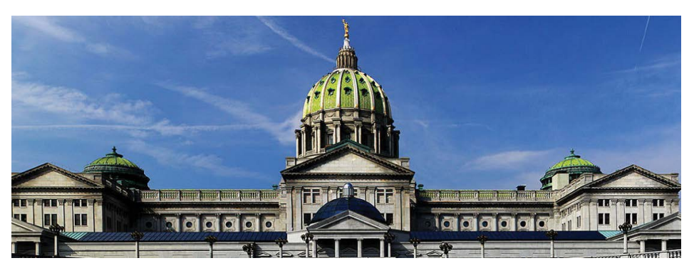
"Pennsylvania Capitol"

As Pennsylvanians continue to feel the increasingly severe impacts of climate change, we must acknowledge that communities of color and low income communities are disproportionately affected."