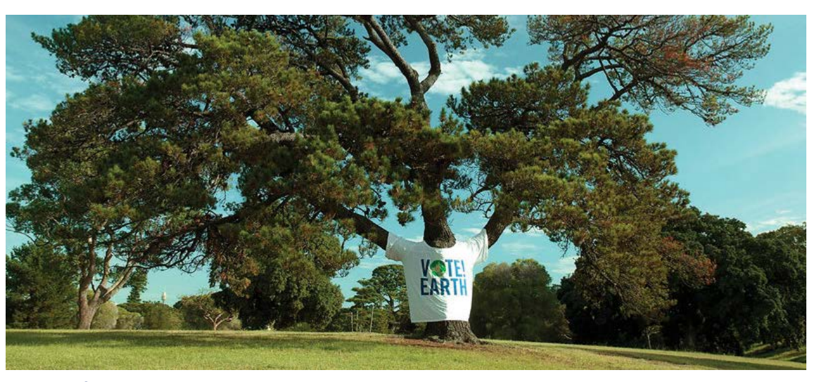
"Vote Earth Tree" by Earth Hour Global

Most of the environmental bills voted on by the House and included in this scorecard are not omnibus or transformational pieces of legislation. Instead, they represent small but meaningful steps forward."