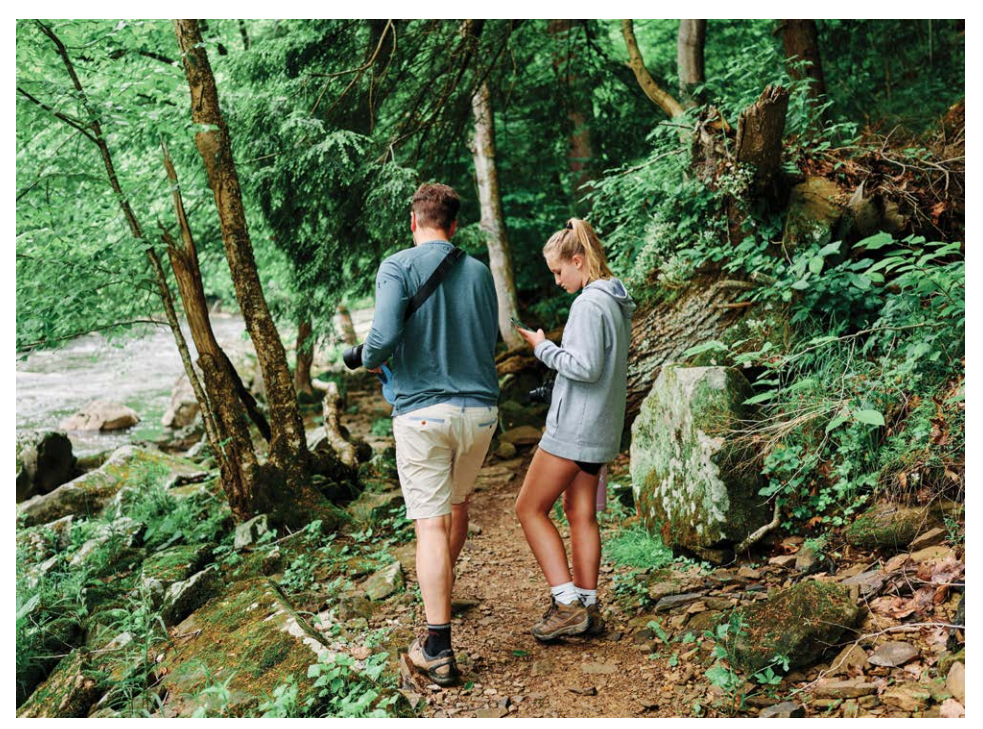
"McConnells Mill State Park"

As Pennsylvanians continue to feel the increasingly severe impacts of climate change, we must acknowledge that communities of color and low income communities are disproportionately affected."