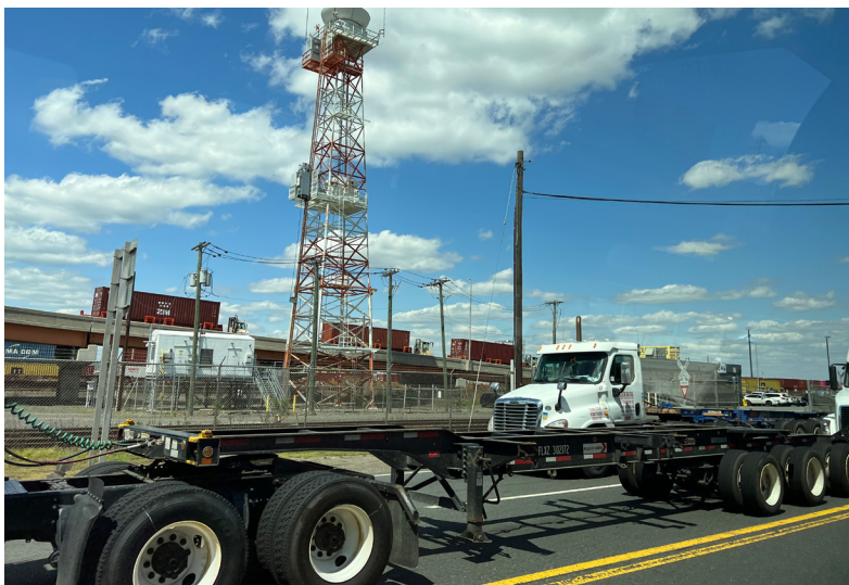
▲ Image of truck traffic in Newark.