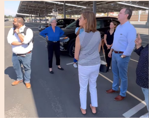
Toxic Tour with Rep Adam Schiff

Lobbying, toxic tours, community events/town halls, etc work to keep those making decision accountable to the community and making sure they are choosing people over profit.