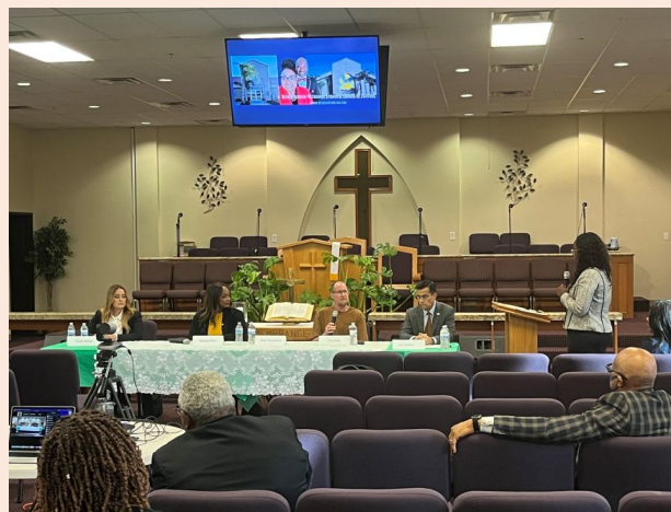
County Supervisor Townhall

EJ Scorecards ranks bills and legislators on their effectiveness in pushing environmental legislation.