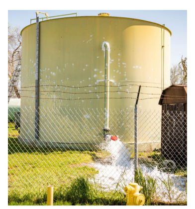
▲ Failing water supply in Allensworth.

Last June, Clean Water Action co-authored a report evaluating how our groundwater resources are being protected (or not!) in California. The findings in <u>SGMA and Underrepresented Farmers</u> show how power imbalances in the state's groundwater basins impact access to water. In collaboration with other environmental justice organizations, we are prioritizing the consideration and protection of vulnerable communities through research and